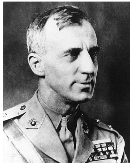
Marine Major General Smedley Butler 2 Time Medal of Honor Recipient

One of the most decorated soldiers in the history of soldiering anywhere in history or for any nation at any point in history was a U.S. Marine named Smedley Butler.