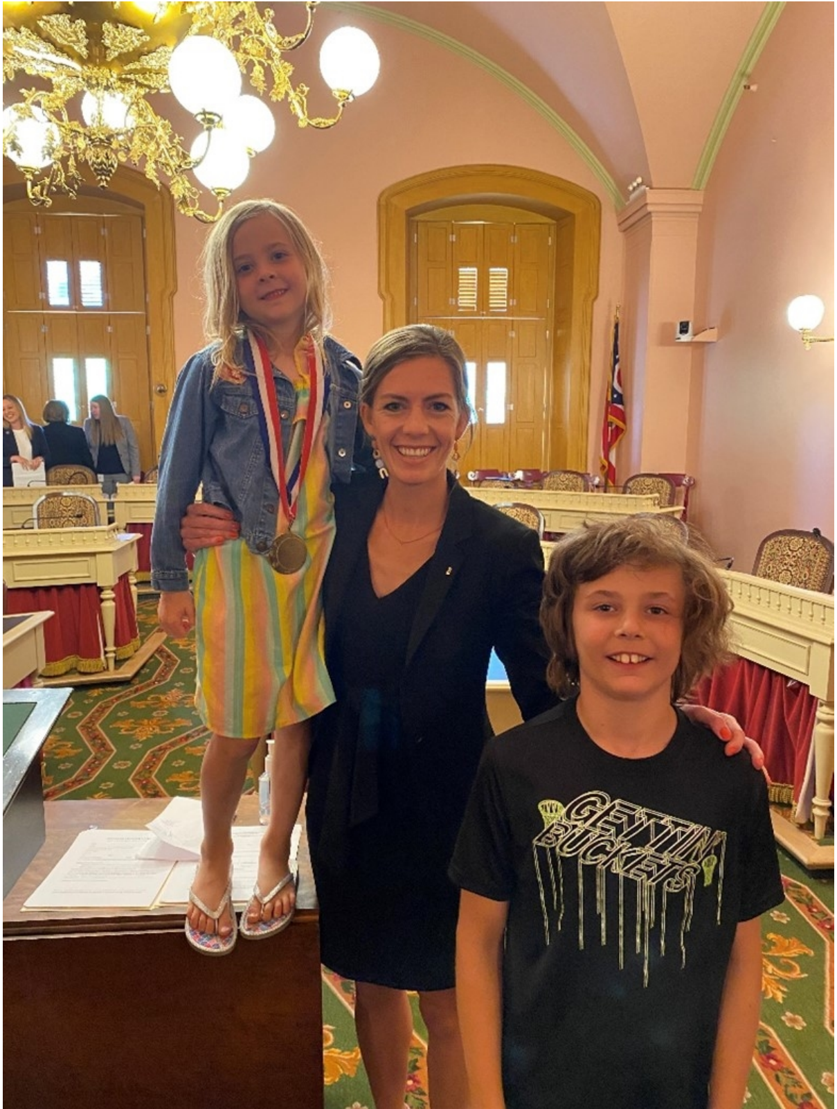
My children are regulars testifying on bills. Here is my daughter two years ago (at age 6 with