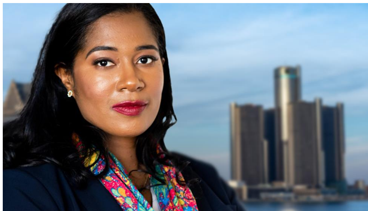
Former Michigan State Senator Pat Colbeck