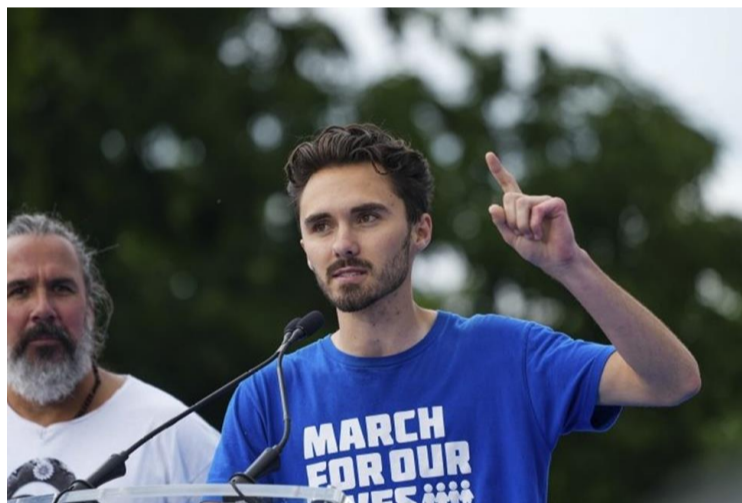
Anti-2A Political Activist David Hogg