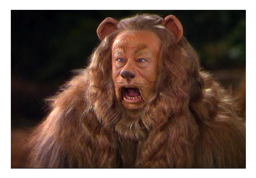
The 2024 election is too important.

If you have any comments or questions for MRP, please contact us at: <a href="mailto:info@puregrassroots.org">info@puregrassroots.org</a>