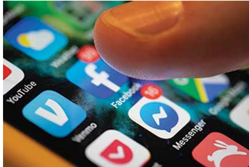
Social Media is Mind Control Ground Zero

The truth is that we are all susceptible to the power of modern psychological warfare and cognitive warfare technologies. Furthermore, there is now a consensus among certain elements of our government that it is acceptable to deploy these methods and technologies in order to avoid the effects of populist movements that could disrupt current policies. Recent examples of disruptive populist political movements that have been used to justify deploying these techniques against U.S. citizens include the rise and impact of Nigel Farage/the U.K. Independence Party/Brexit and the election of President Donald Trump.