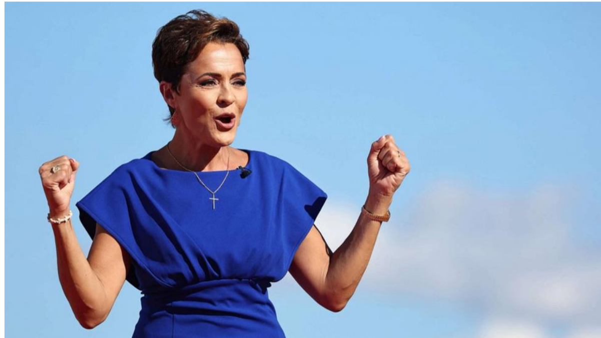
Woot! Woot! Get on the Kari Lake train!

Kari Lake is the real deal. She can't be bribed. She can't be threatened. She is on a mission of advancing Pro-American, anti-Globalism policies like few other before her. If you have had the good fortune to meet her in person, you would know that she does this all with humility and good humor.