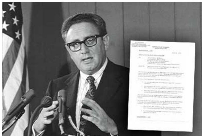
Few Have Managed to Inject Evil in the World Like Henry Kissinger

Conspicuously, the plan noted that the decline in fertility would take time and that patient gradualism would be the way forward. “Given the laws of compound growth, even comparatively small reductions in fertility over the next decade will make a significant difference in total numbers by the year 2000, and a far more significant one by the year 2050,” the plan states.