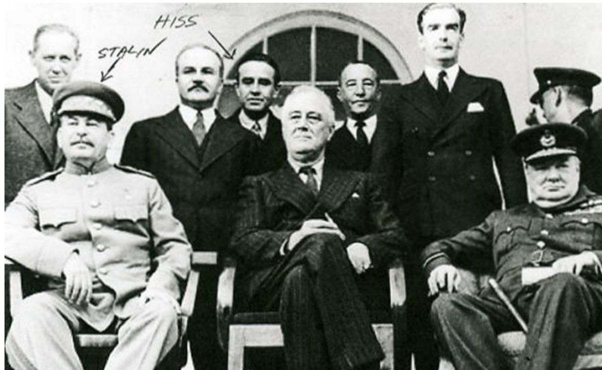
Communist Agent Alger Hiss was Stalin's "Ace" at Yalta

These men surely did not want the nations of the world to remain independent. Instead, they wanted all to become subject to the authority of the United Nations, an organization they expected to control. And they wrote the UN Charter to accomplish that goal.