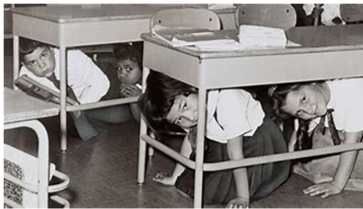
School Drills during the Cuban Missile Crisis in 1962

Just like porno books for 3 rd graders, these ridiculous ideas are endless in number and never ending in creativity and implementation. And they are very creative. Not that long ago the globalist elite had people building bomb bunkers in their backyard and schoolchildren doing drills hiding underneath their desks.