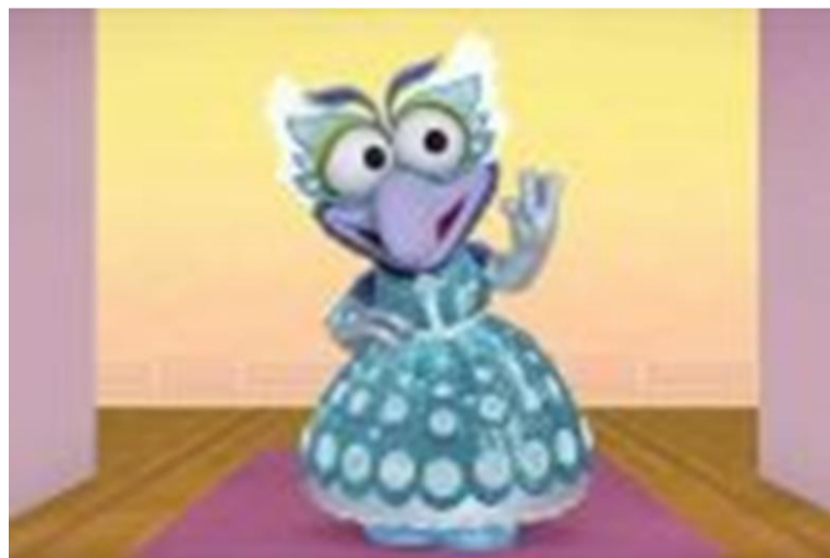
Disney turned Baby Gonzo into a "nonbinary"

Businesses boost their indices by virtue-signaling their support for the homosexual agenda. That explains all the corporate-sponsored "pride" events and rainbow-flag waving.