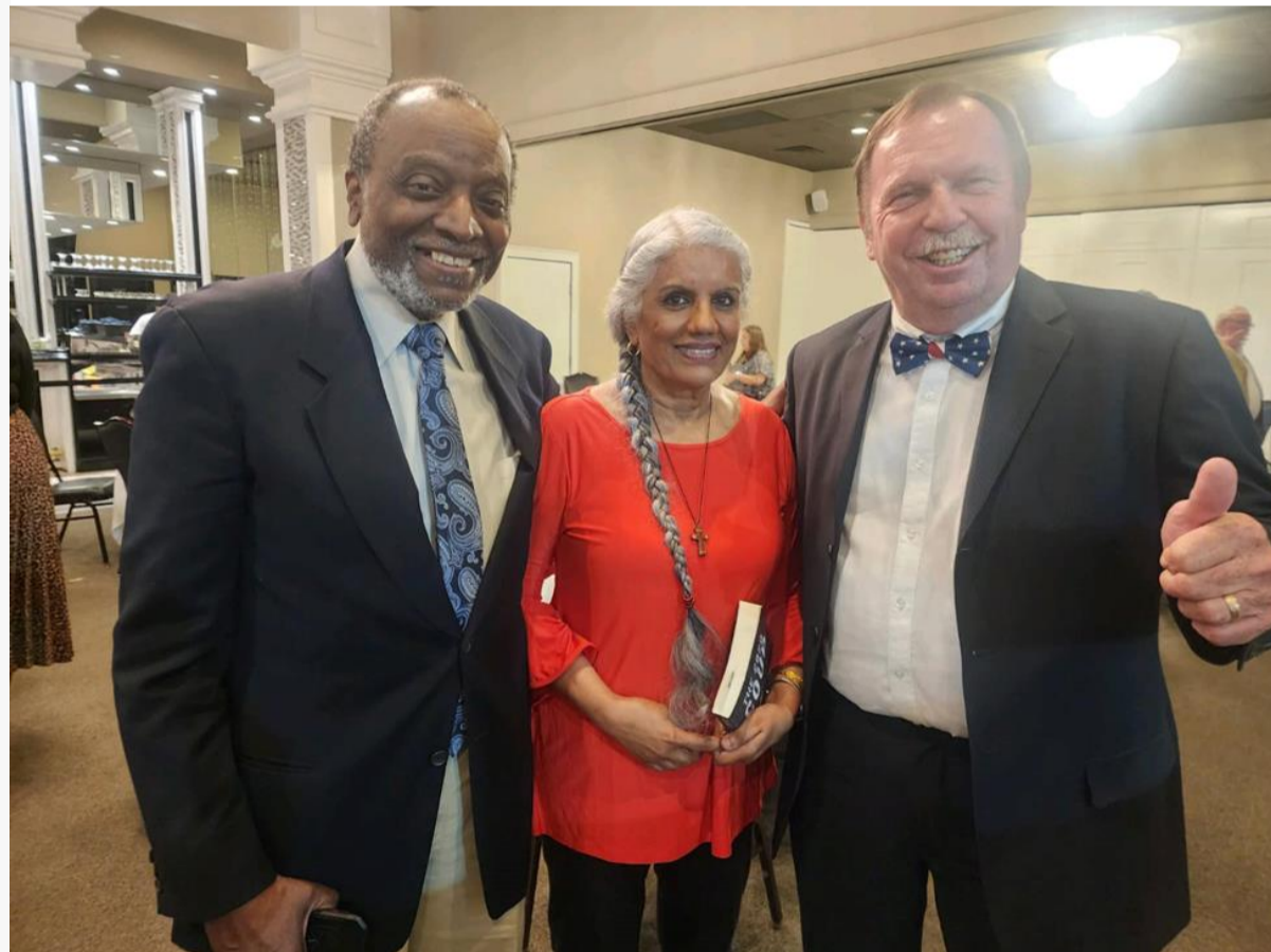
Friday night was a packed House!