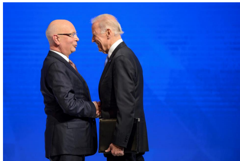
Klaus Schwab & Joe Biden

First and most important, Biden is the ultimate puppet and together with empty suit Kamala Harris, the globalists that own them both do not need to worry about their servants going "off reservation" one bit. They are nothing but window dressing for the powers behind the throne and so long as the globalists think that Americans will accept this, they will let it play out. Biden is indeed a "Manchurian candidate."